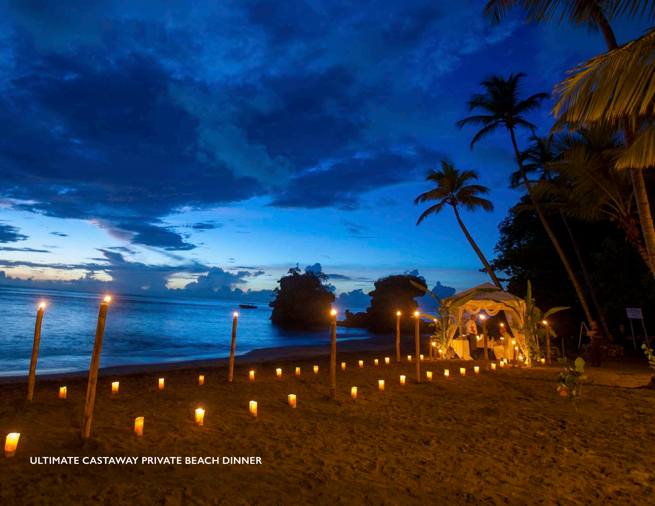
ULTIMATE CASTAWAY PRIVATE BEACH DINNER