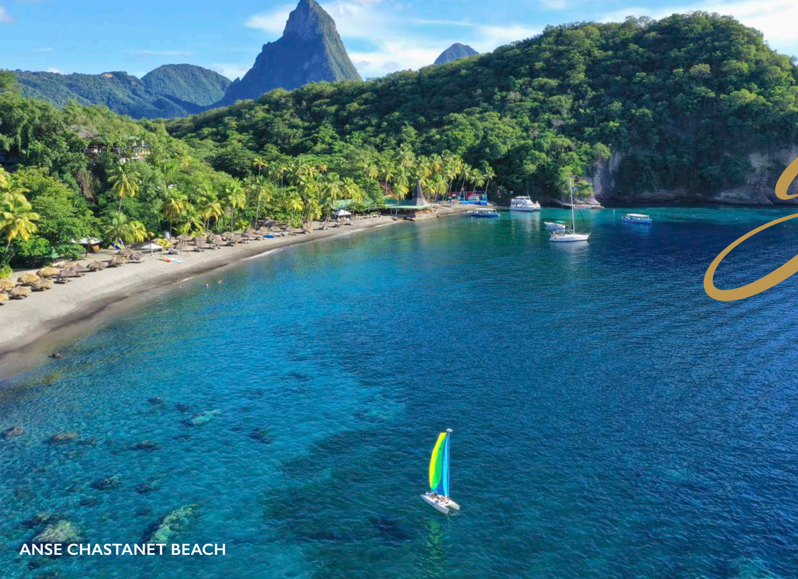
ANSE CHASTANET BEACH

Jade Mountain guests may enjoy two soft sand beaches which belong to the resort's 600 acre estate shared with sister property Anse Chastanet.