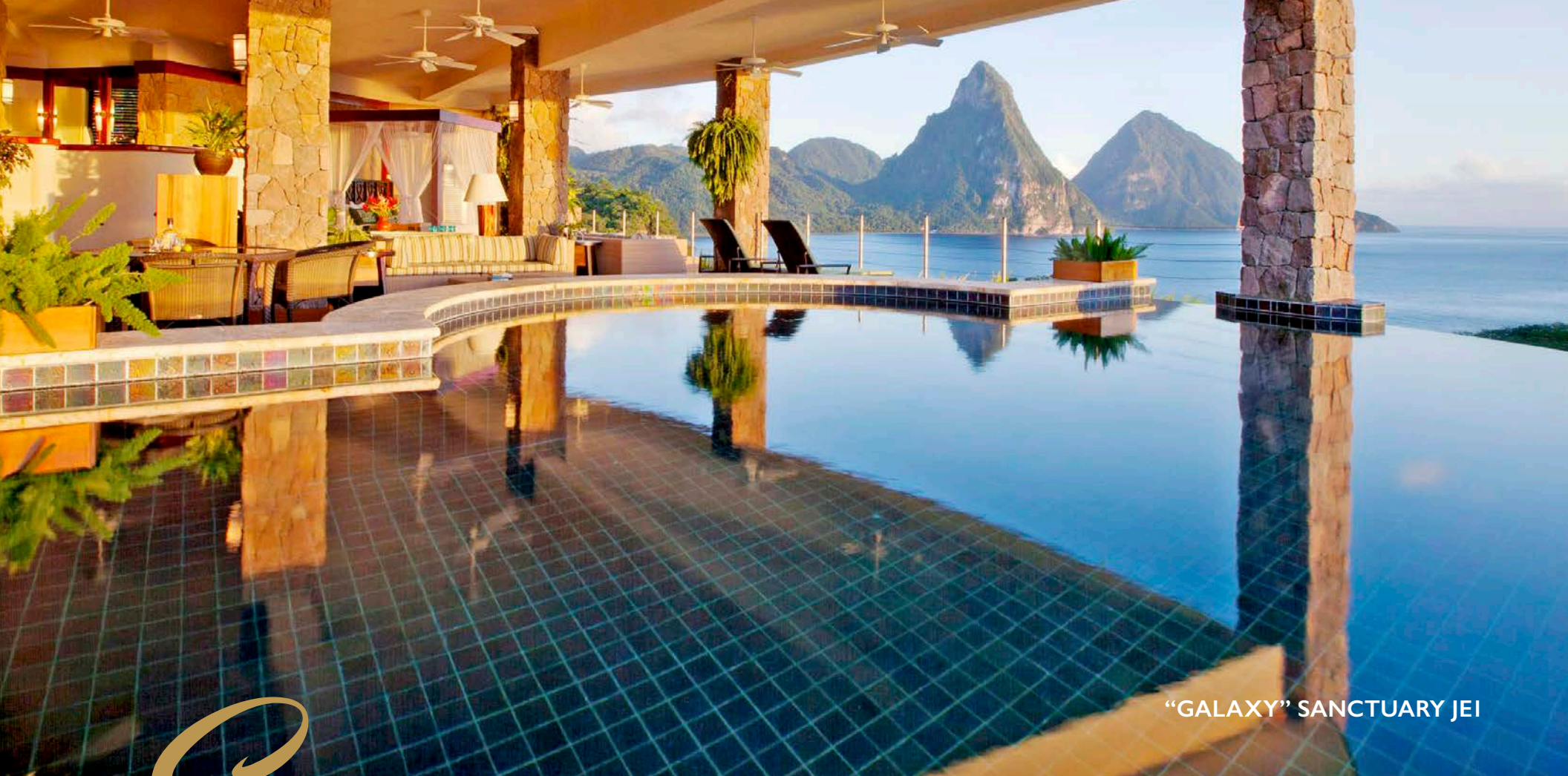
“GALAXY” SANCTUARY JEI

Expect grand sweeping spaces where bedroom, living area and an extravagant private infinity pool glide into one another to form extraordinary platforms floating out into nature. With the fourth wall entirely absent, Jade Mountain’s sanctuaries are stage-like settings from which to embrace the full glory of Saint Lucia’s Pitons World Heritage Site, and of course, the eternal Caribbean Sea.