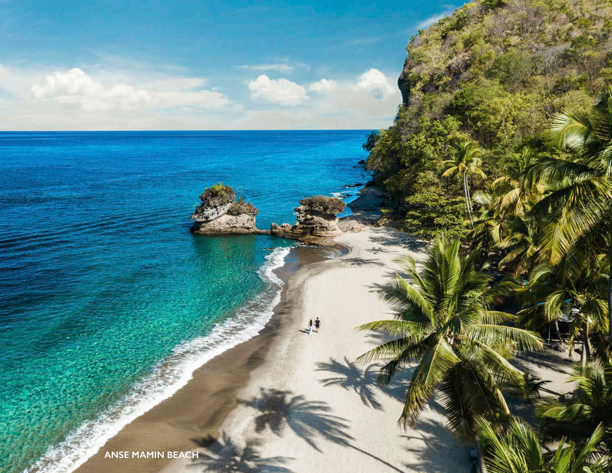
ANSE MAMIN BEACH