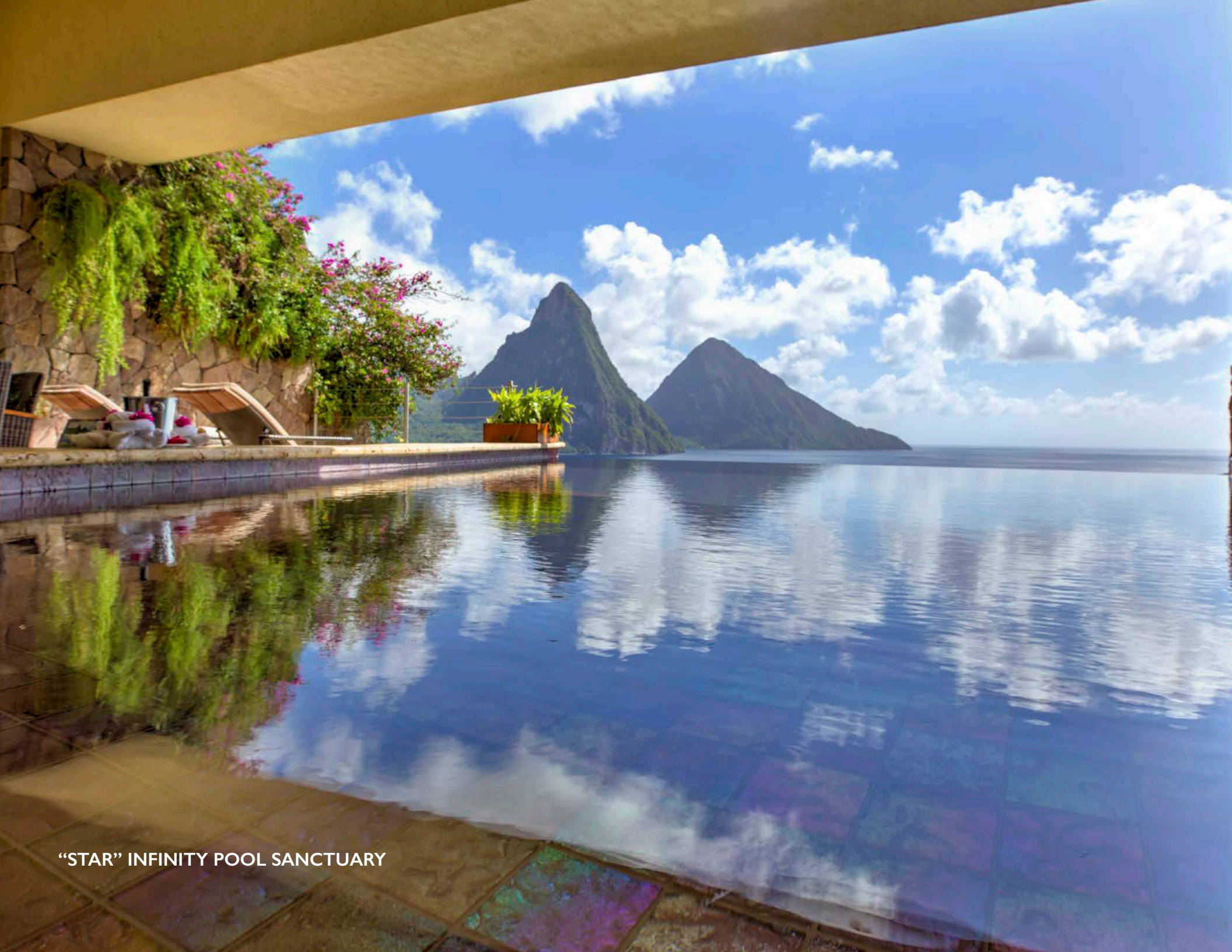
“STAR” INFINITY POOL SANCTUARY