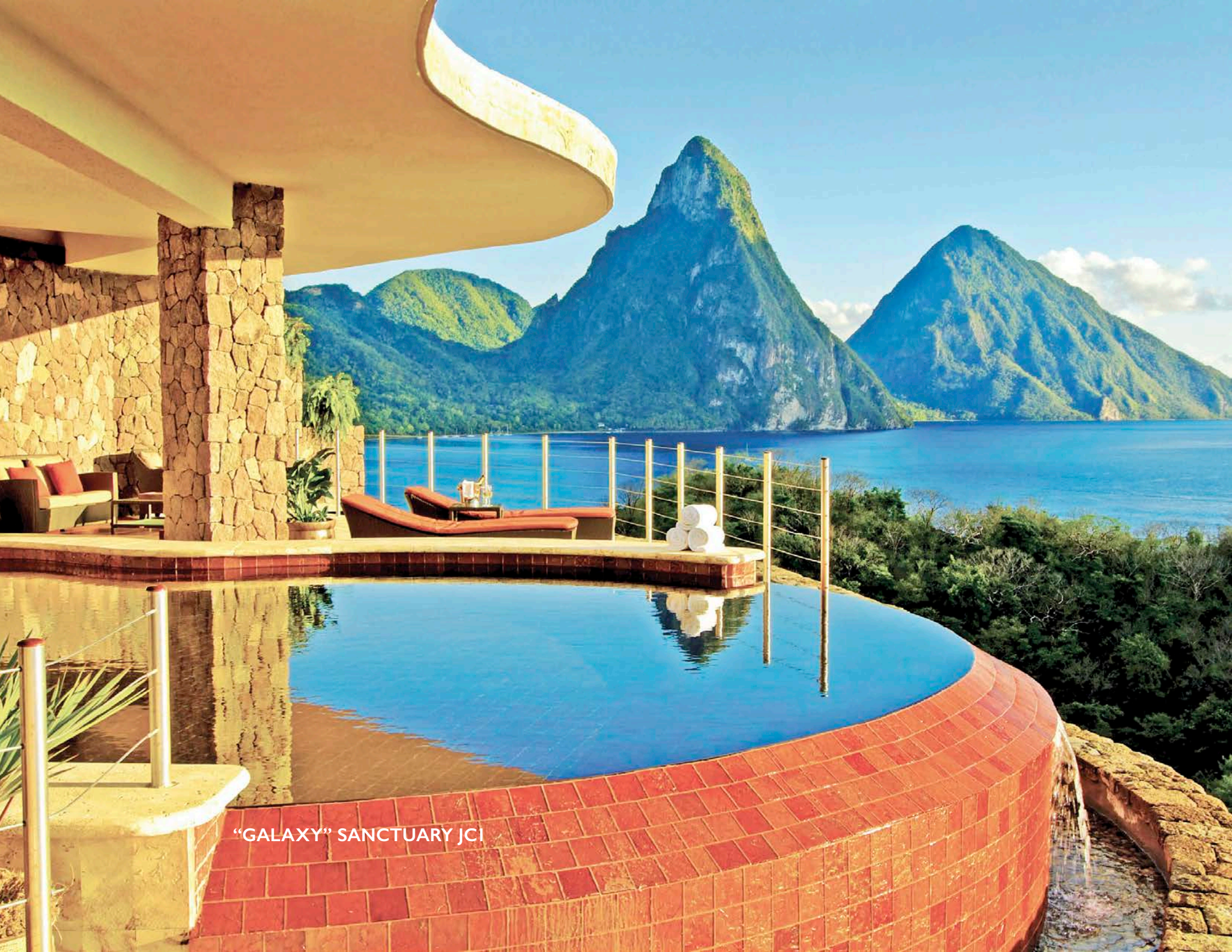
“GALAXY” SANCTUARY JCI