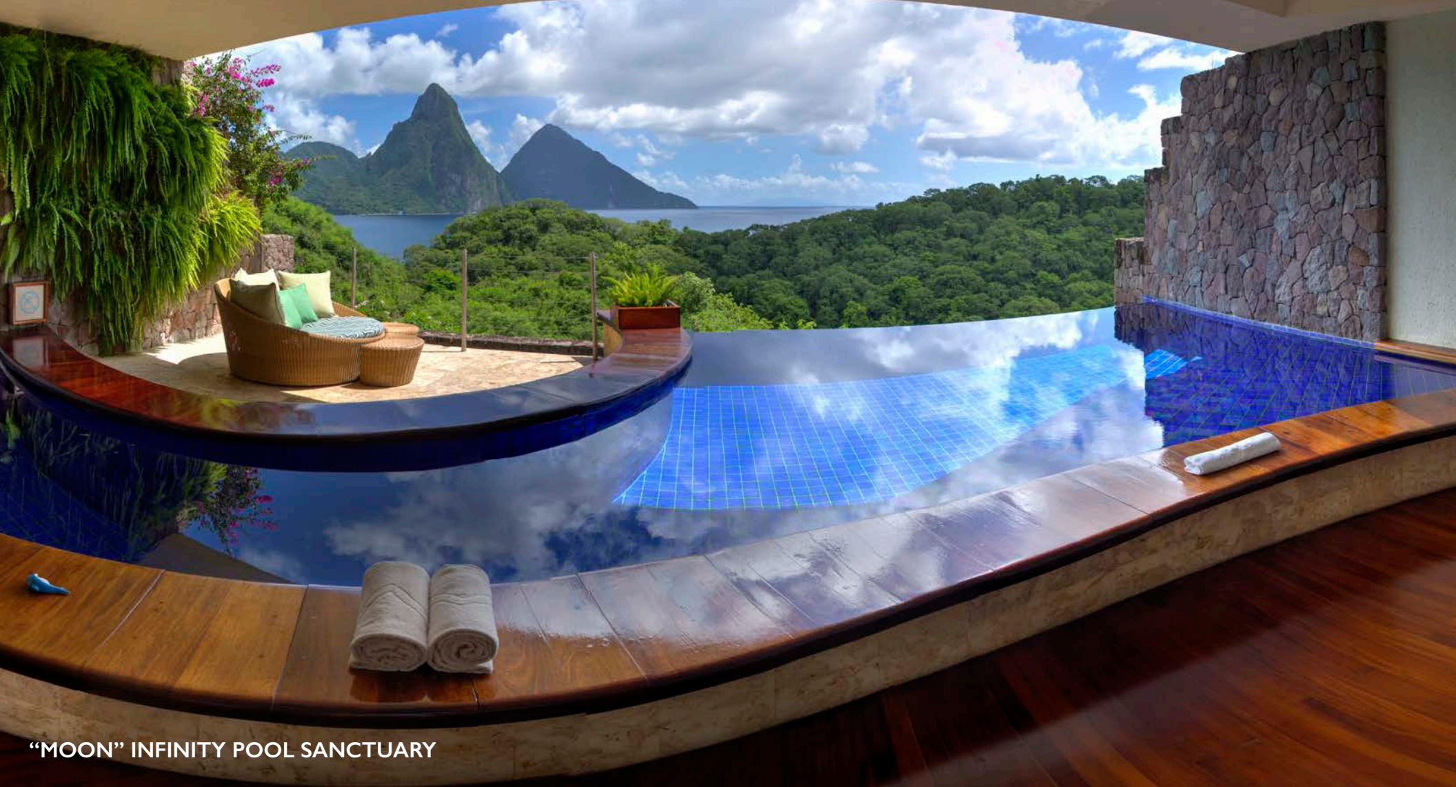
“MOON” INFINITY POOL SANCTUARY