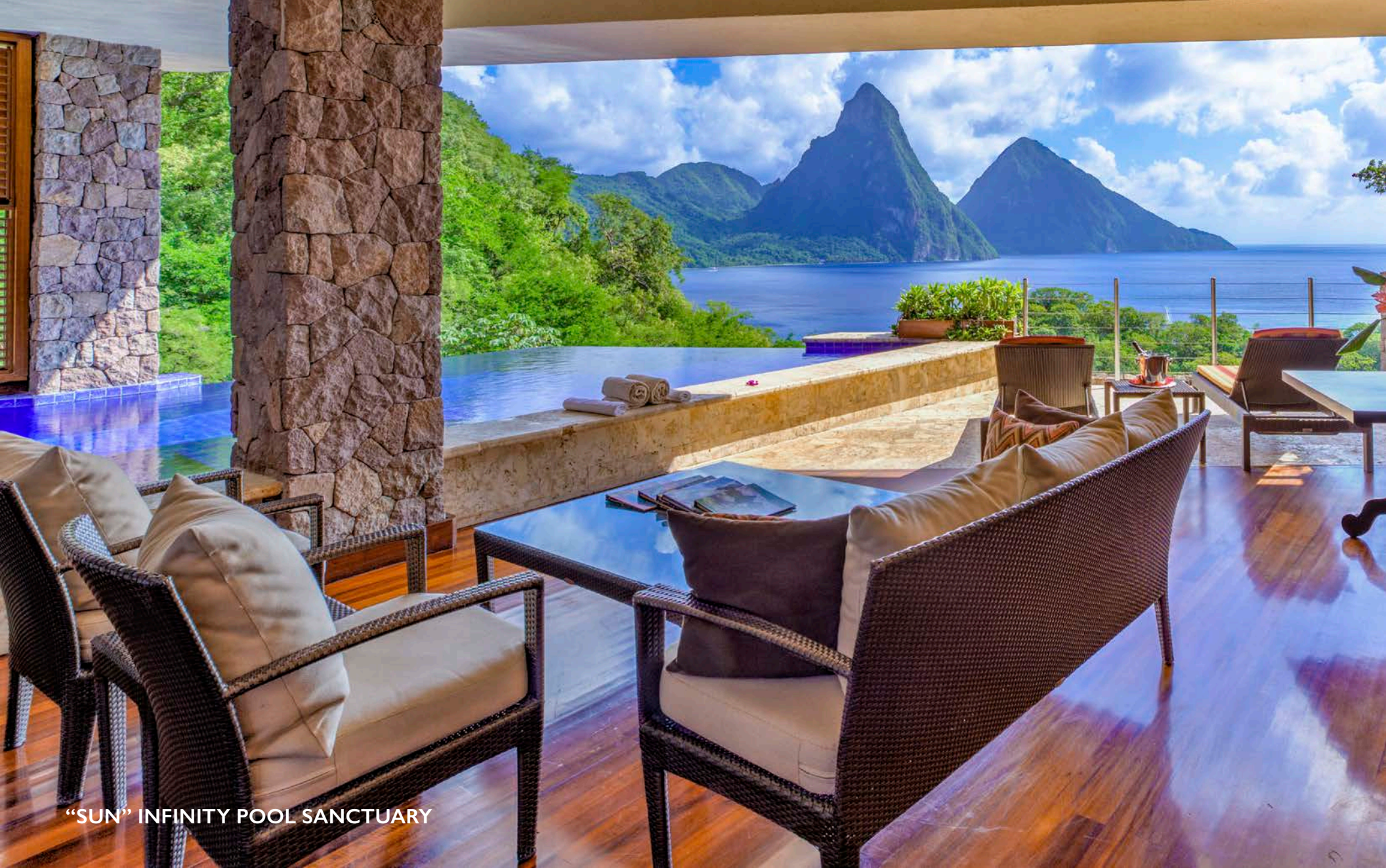
“SUN” INFINITY POOL SANCTUARY

The interior walls are finished in a crushed blush toned coral plaster quarried in Barbados. The exterior is in massive rough concrete and imbued with locally quarried stone, with all the window openings framed with massive 3 x 18 inch tropical wood mullions and muntins which are in-filled with movable jalousie louvres. The flooring exposed to the weather is finished in quarried coral tile from neighboring islands.