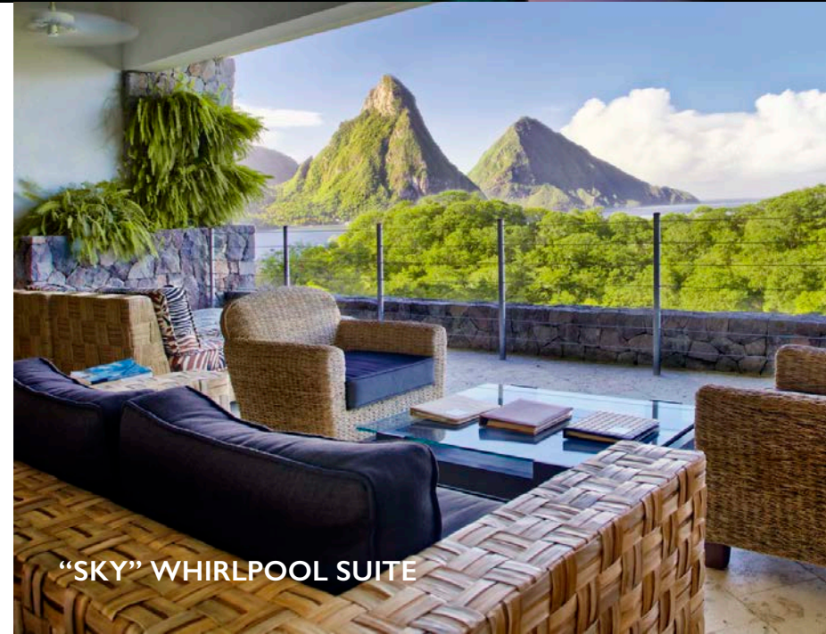
“SKY” WHIRLPOOL SUITE

In addition to the 24 infinity pool sanctuaries at JADE MOUNTAIN, there are 5 SKY whirlpool suites. The SKY suites are located in the lower hillside level of JADE MOUNTAIN and do not have a private infinity pool. The SKY suites are up to 1650 square feet, with the 4th wall open to Piton and ocean views. SKY suites feature a two level room lay out, with a large and comfortable living space and open bath design, with a raised couple's whirlpool tub towering above the living space and also open to view.