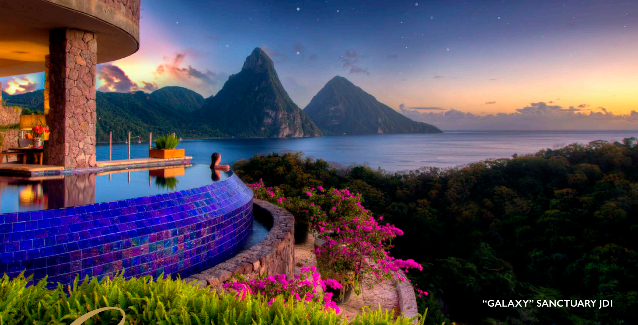
“GALAXY” SANCTUARY JDI