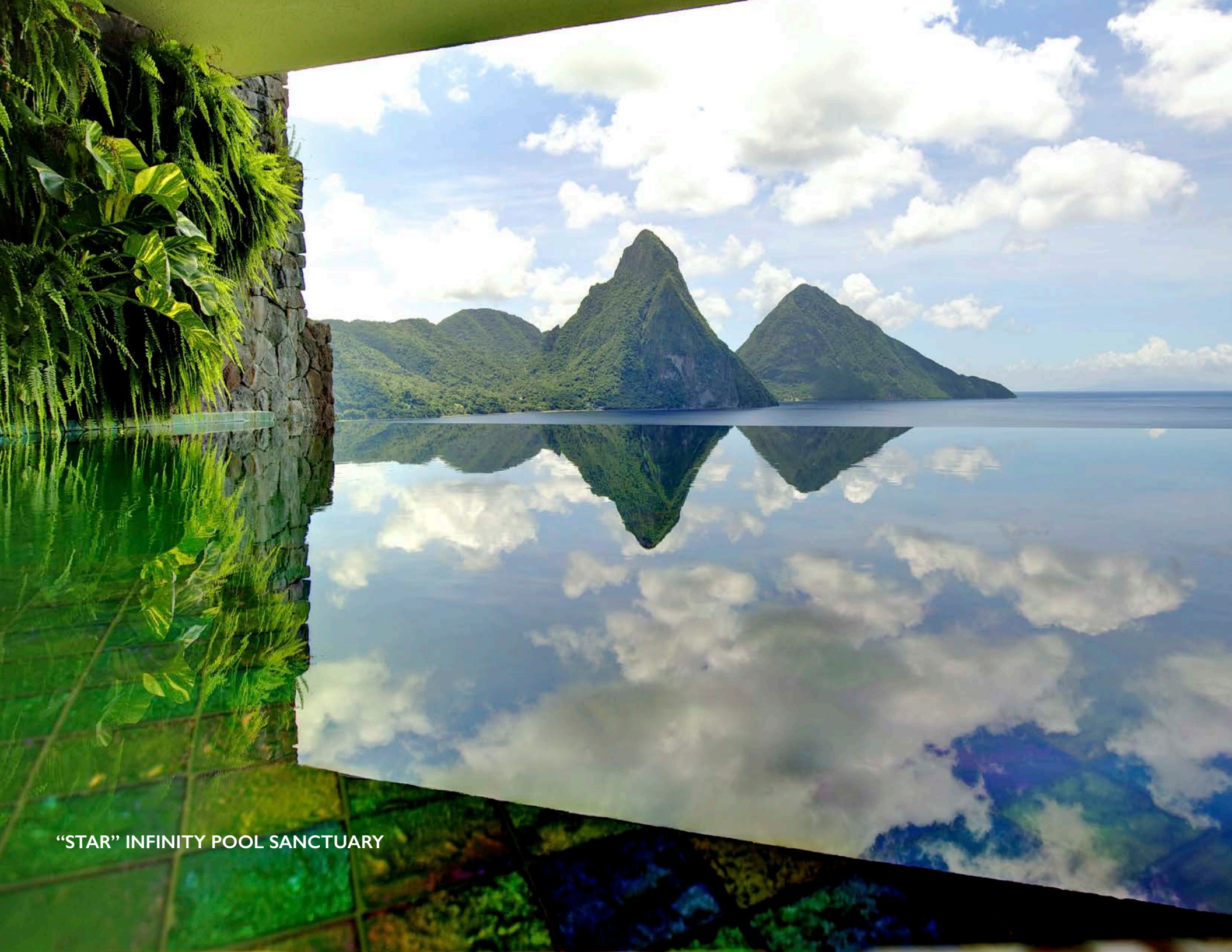
“STAR” INFINITY POOL SANCTUARY